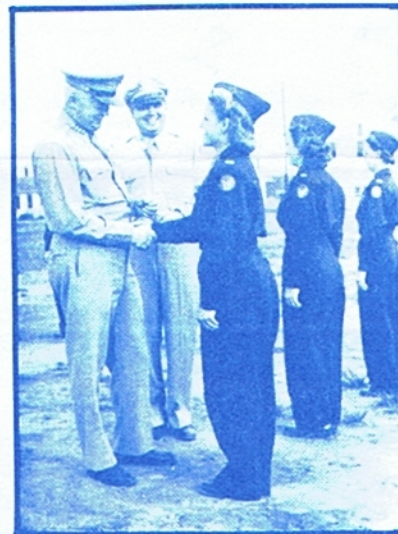
Above: Gen H.H. "Hap" Arnold offers congratulations.