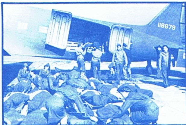
Left: Practicing Air Evacuation

Don't Be Left Out — Buy Your Book Now!!!