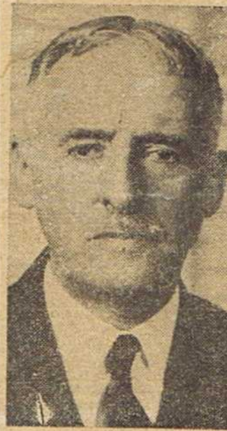
HENRY L. STIMSON, Secretary of War, arrived in Italy yesterday for a series of inspection tours and conferences.